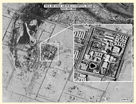
Image of MEK headquarters complex from US Dept. of State publication "Saddam Hussein's Iraq," Sept. 1999 (Updated 3/24/00)