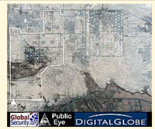
Overview of MEK training camp, as of 10/26/02.