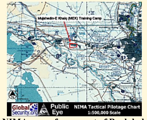
NIMA map of area west of Baghdad, showing MEK training facility.