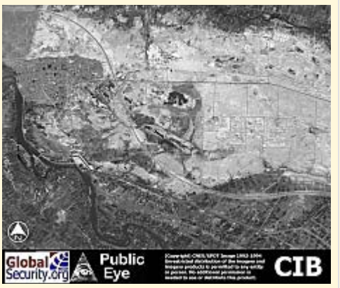
CIB image showing MEK Training Camp to the east of the city of Fallujah.