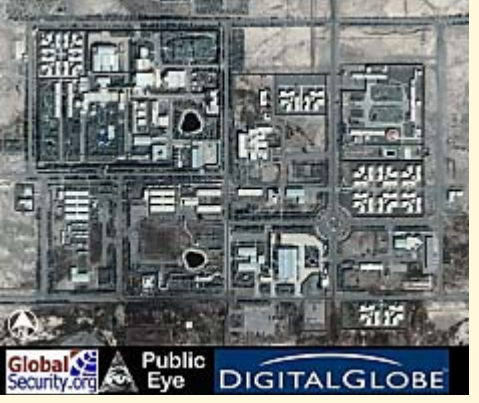
View of headquarters complex of MEK facility, 10/26/02.